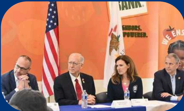
Roundtable at Northern Illinois Food Bank July 10, 2025

Want to stay up to date? Sign up for my e-newsletter!