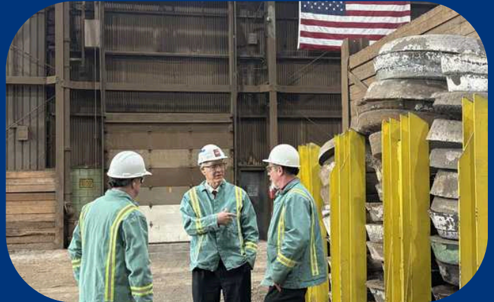
Visit to Dura-Bar in Woodstock September 25, 2025