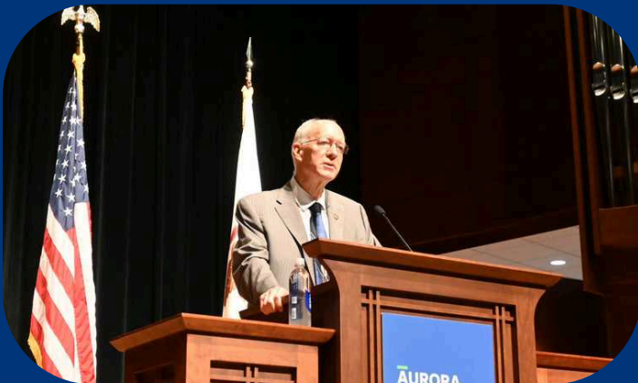
Rep. Foster's town hall at Aurora University July 29, 2025